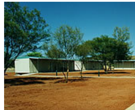
Typical mine-site camp accommodation

The project will deliver a design for temporary accommodation modules that incorporates sustainable elements that are integrated into the existing manufacturing process or retrofitted on site and achieve several valuable outcomes, including lessons that will inform future design work at camp or village scale, the maximising of energy efficiency in camp accommodation modules, the minimisation of water use and the investigation of the potential for alternative energy generation and its inclusion where feasible.